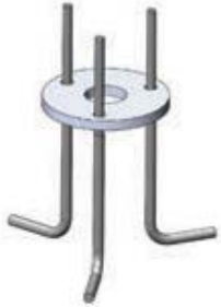
AC065 Anchorage Unit