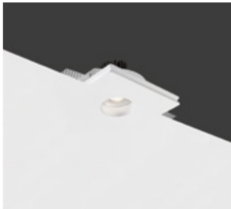
Basic Round Dim To Warm