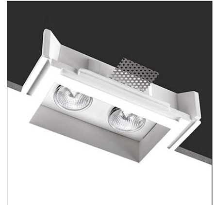
DOUBLE BEAM (BILIGHT)