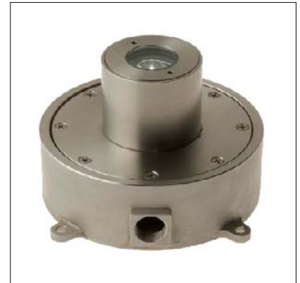
Fixture Dimensions Ø2.5" x 4.0" h See Full Drawing on page 2