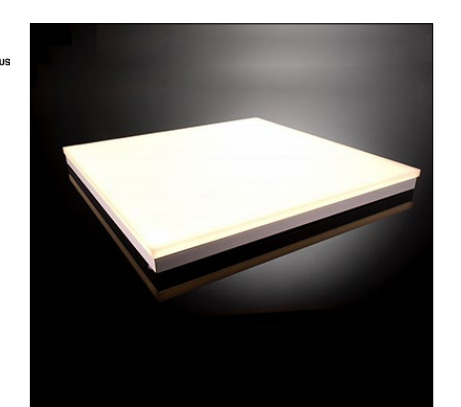
Sample Fixture Dimensions (5' x 5')