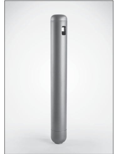
Fixture Dimensions Ø4.5" x 35.4" h