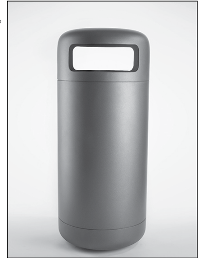
Fixture Dimensions Ø15.75" x 35.4"h