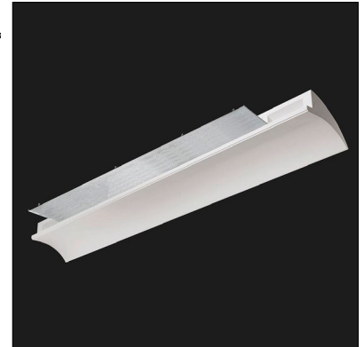
Fixture Dimensions & Parts See page 2