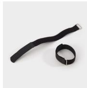
CABLE CLAMP STRIP Included