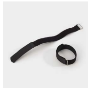
CABLE CLAMP STRIP Included