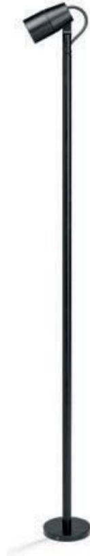
AC070 35.4" Extension Pole