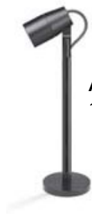
AC068 11.8" Extension Pole