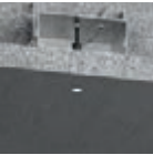
GENIUS CONCRETE IP65 see page 407