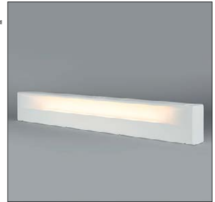
Ceiling Cut-Out: 50.98" x 7.32" Fixture Dimensions