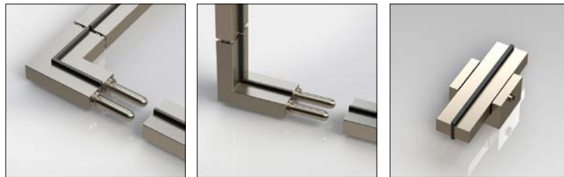
Horizontal Corner Connector Vertical Corner Connector Holders: Screw On, Glue On, Magnetic