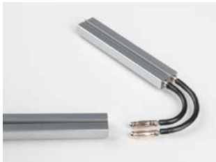
A500501 Corner Connector - Flexible