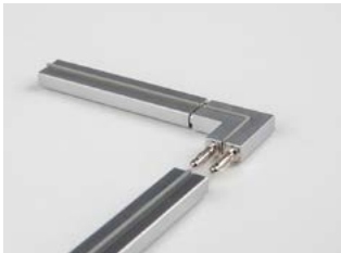
A300084-H-__ Corner Connector - Horizontal