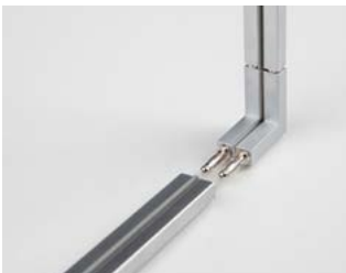
A300084-V-A-__ Corner Connector - Vertical - Small