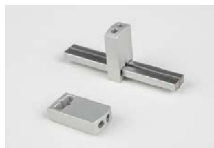
Glass Shelf Holder