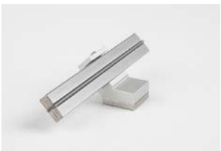
A300090-__ Holder on Glass, 45°, Magnetic Only available in 2 finishes below. SI - Silver SW - Black