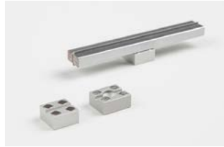
A300069-__ Holder - Symmetric, Mini, Glue On

Finishes (add one to end of code) CH - Champagne HA - Hard Anodized ME - Gold SI - Silver SW - Black