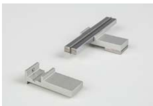
Holder on Glass, Straight, Magnetic