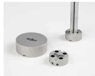
Puck 1.02" or 1.77"