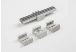
A300071-__ Holder, Symmetric, Glue On