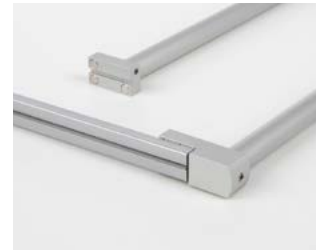
Adapter For Showcase Installation