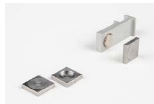
Steel Plate - Glue On For Magnetic Fixation on Glass