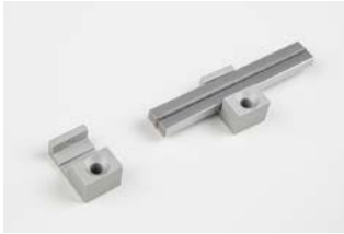
A300068-__ Holder - Asymmetric, Screw on