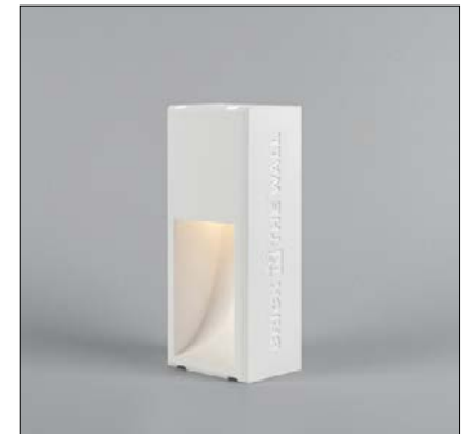
Ceiling Cut-Out: 4.02" x 9.37" Fixture Dimensions