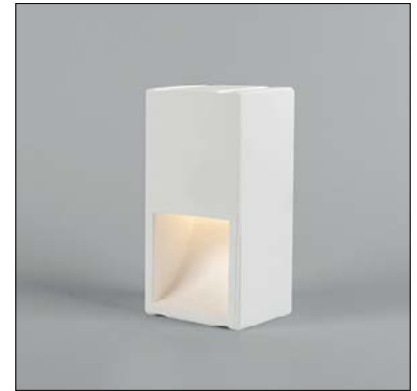
Ceiling Cut-Out: 4.02" x 7.48" Fixture Dimensions