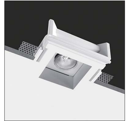
SINGLE BEAM (MONOLIGHT)