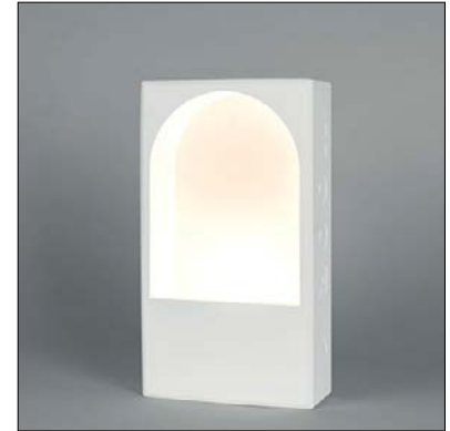
Ceiling Cut-Out: 8.86" x 15.75" Fixture Dimensions