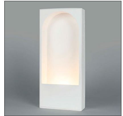
Ceiling Cut-Out: 8.86" x 19.69" Fixture Dimensions