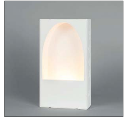
Ceiling Cut-Out: 8.86" x 15.75" Fixture Dimensions