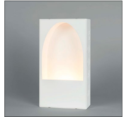
Ceiling Cut-Out: 8.86" x 15.75" Fixture Dimensions