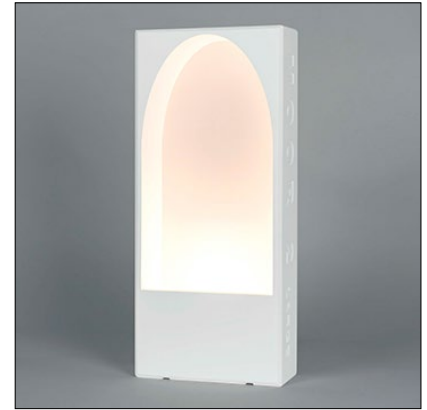
Ceiling Cut-Out: 8.86" x 19.69" Fixture Dimensions