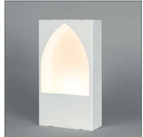
Ceiling Cut-Out: 8.86" x 15.75" Fixture Dimensions