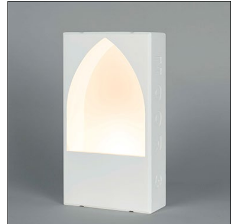
Ceiling Cut-Out: 8.86" x 15.75" Fixture Dimensions