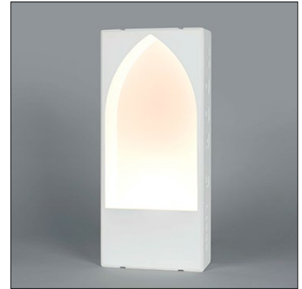
Ceiling Cut-Out: 8.86" x 19.69" Fixture Dimensions