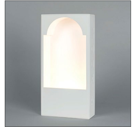
Ceiling Cut-Out: 8.86" x 17.52" Fixture Dimensions