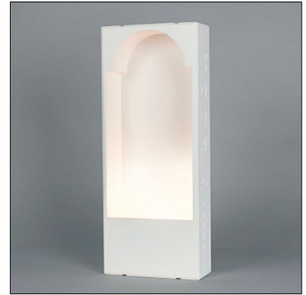
Ceiling Cut-Out: 8.86" x 21.46" Fixture Dimensions