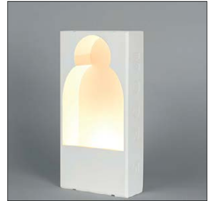
Ceiling Cut-Out: 8.86" x 17.52" Fixture Dimensions