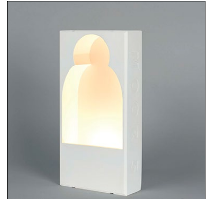
Ceiling Cut-Out: 8.86" x 17.52" Fixture Dimensions