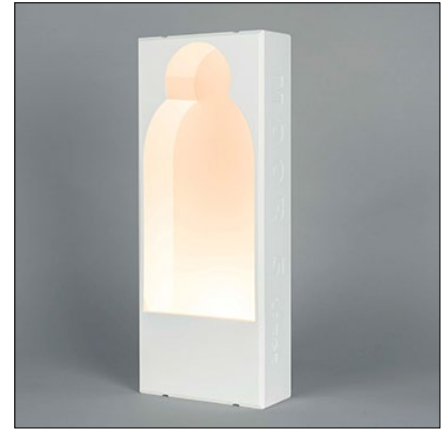
Ceiling Cut-Out: 8.86" x 21.46" Fixture Dimensions