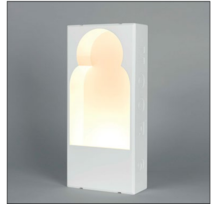
Ceiling Cut-Out: 8.86" x 18.90" Fixture Dimensions