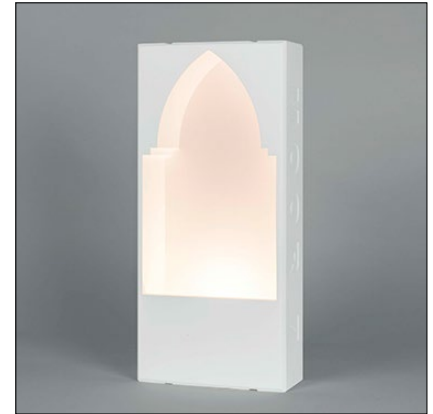
Ceiling Cut-Out: 8.86" x 18.90" Fixture Dimensions