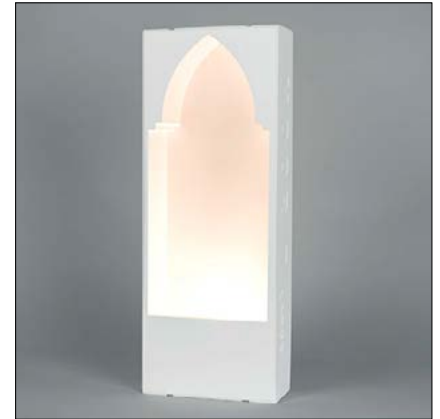
Ceiling Cut-Out: 8.86" x 22.83" Fixture Dimensions