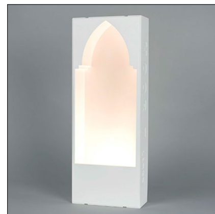
Ceiling Cut-Out: 8.86" x 22.83" Fixture Dimensions