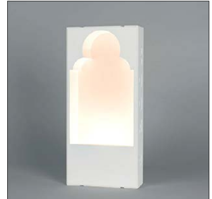
Ceiling Cut-Out: 8.86" x 18.90" Fixture Dimensions