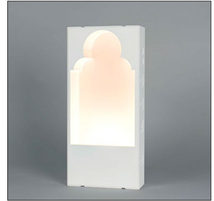
Ceiling Cut-Out: 8.86" x 18.90" Fixture Dimensions