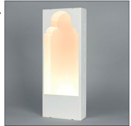
Ceiling Cut-Out: 8.86" x 22.83" Fixture Dimensions