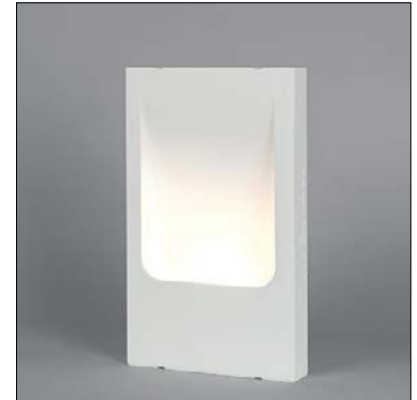
Wall Cut-Out: 10.43" x 17.32" Fixture Dimensions