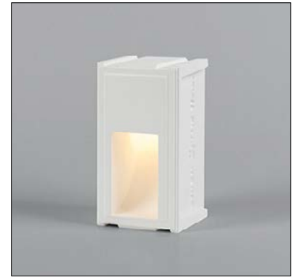
Ceiling Cut-Out: 2.80" x 5.43" Fixture Dimensions