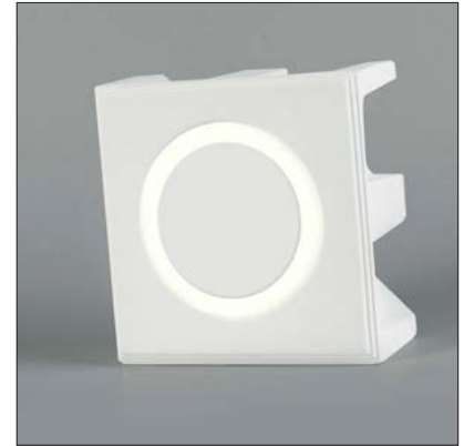
Wall Cut-Out: 5.20" x 5.20" Fixture Dimensions