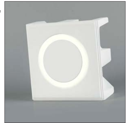
Wall Cut-Out: 5.20" x 5.20" Fixture Dimensions