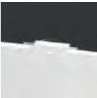
PIXEL see page 163