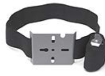
AC038 Tree Strap for Ring Series