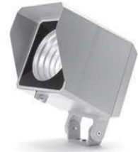
AC078 Anti-Glare Visor