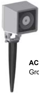
AC044 Ground Spike