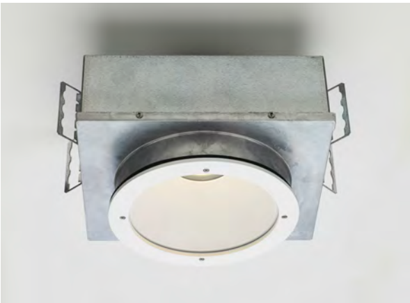
RDP Clear P olycarbonate Bottom Lens