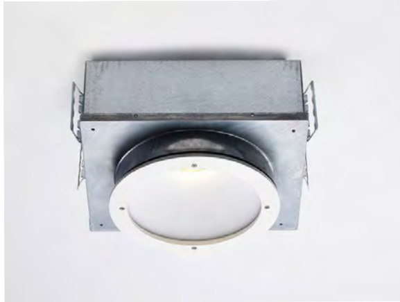
RDW Translucent W hite Opal Lens