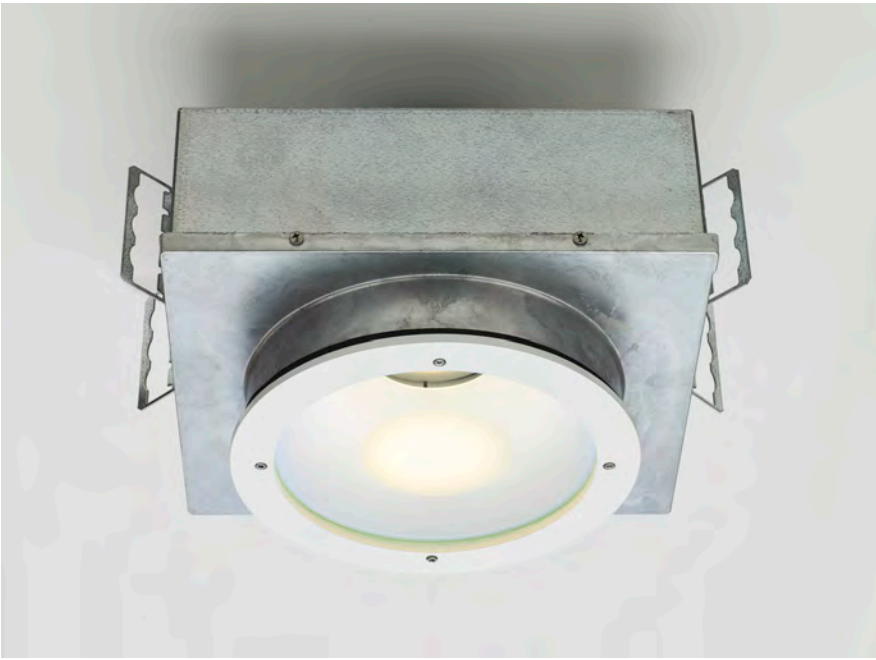
RDD Clear Bottom Lens with Center Diffusing Dot