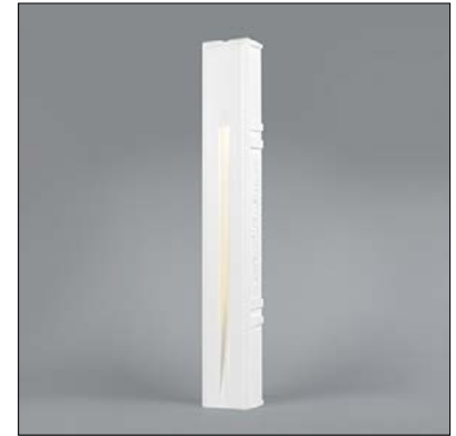
Ceiling Cut-Out: 3.27" x 21.65" Fixture Dimensions