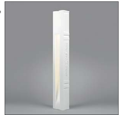
Ceiling Cut-Out: 3.27" × 21.65" Fixture Dimensions