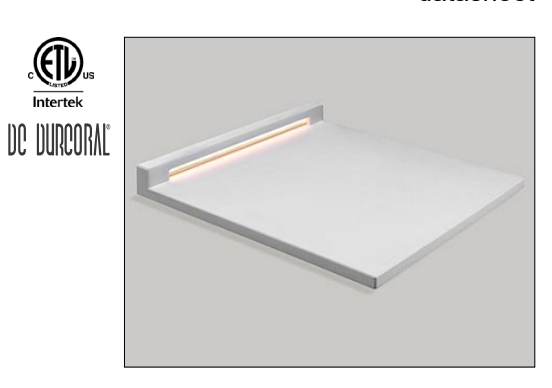
Fixture Dimensions 19.69" I x 19.69" w x 1.57" total height (tile is 0.79"h)

The body is made of DurCoral®, a high-performance "hi-tech" material born from the union of Coral® and cement. It is an aggregate twice as hard as concrete, which allows very high performances in terms of quality, flow and resistance and that, above all, differs from other outdoor materials, for the possibility of being treated with any type of paint and finish. Distinguished by the ability to resist abrasion, insensitive to ultraviolet rays, pollution and atmospheric agents is certainly the ideal material to be placed outdoors.