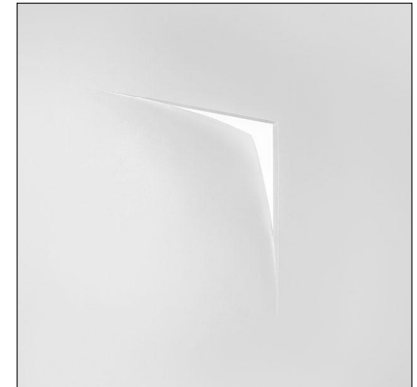
Ceiling Cut-Out: 18.1" x 18.1"