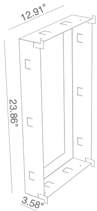
708 01 000 Outer Casing