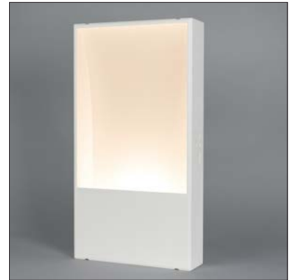
Wall Cut-Out: 12.95" x 23.90" Fixture Dimensions