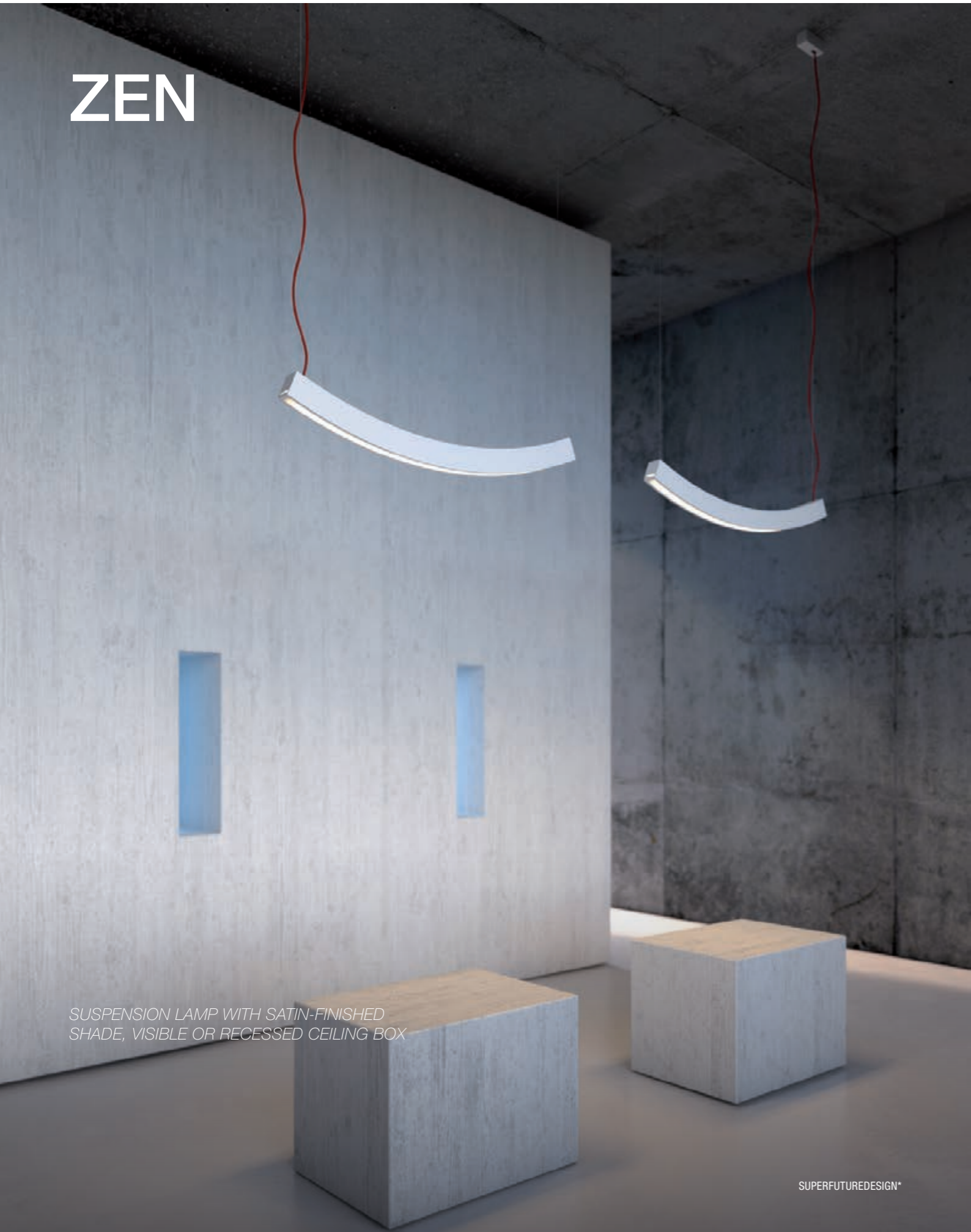
SUSPENSION LAMP WITH SATIN-FINISHED SHADE, VISIBLE OR RECESSED CEILING BOX